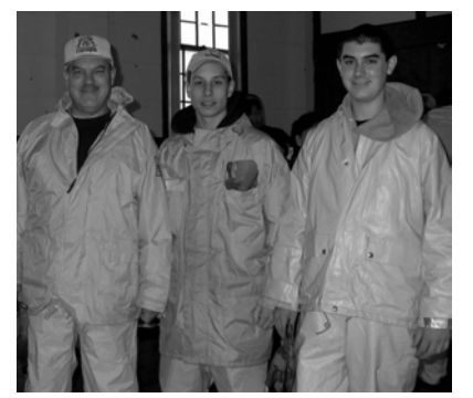
(above) Members of the Hudson River Fishermen's Association know how to dress for the weather (below) Girl Scouts brave the rain and wind in Seaside Park