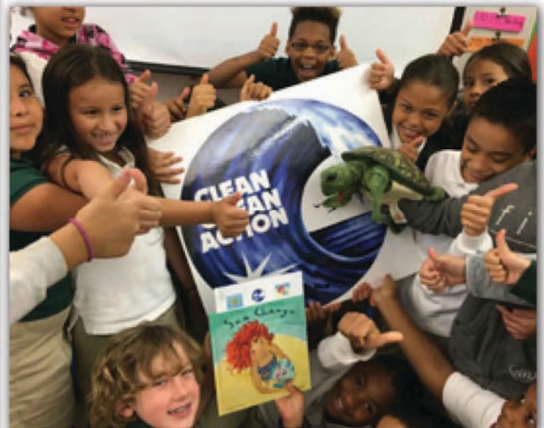
Third graders at Anastasia School, Long Branch