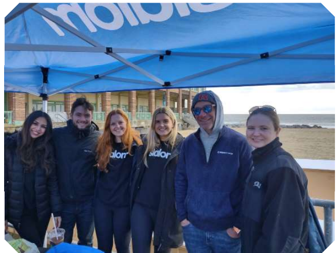
Site Sponsor Slalom