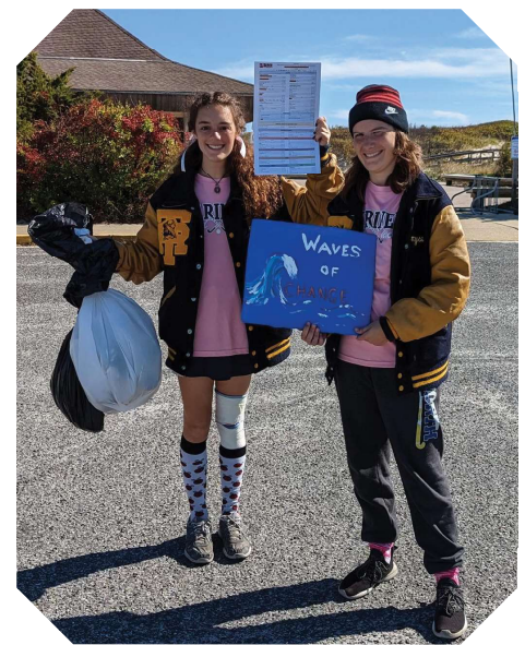
This dynamic sister duo make waves as they collect trash and data