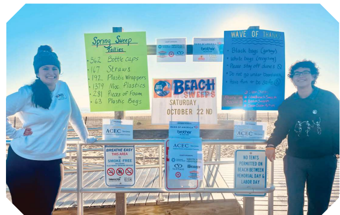
Jr. Beach Captain, Grace Harrivan, and friend share their site setup with Spring tallies and more!

NOTES FOR BEACH SWEEPS DATA: The Annual Beach Sweeps Report can be used to study and understand marine debris. When analyzing annually or over time for trends, it is important to note that the amount of debris collected depends on a variety of factors, such as weather, tides, participants, and accuracy.