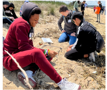
Students learn about microplastics while collecting them at Sandy Hook Student Summit