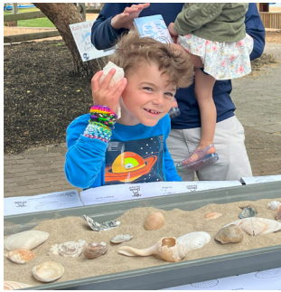
Listening to shell phone at Eco-Fest