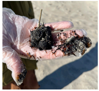
Informed by a local fisherman and surfers, COA alerted federal and state agencies to respond to a beach wash-up of tar balls and oil blobs from Asbury Park to Monmouth Beach