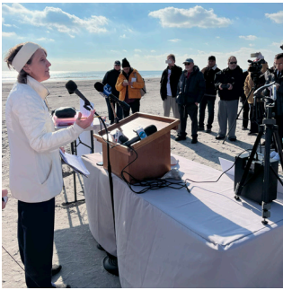
COA Press Conference in Atlantic City, NJ on 1/9/23 following the 5th whale death