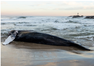
Whale #11 stranded in Manasquan, NJ

Led campaigns with thousands of people for responsible, reasonable, and accountable protections of the ocean and marine life. COA's petition for a federal investigation into the unprecedented deaths of 38 whales and 60 dolphins/porpoises in NY/NJ Bight supported by nearly 400,000 people.