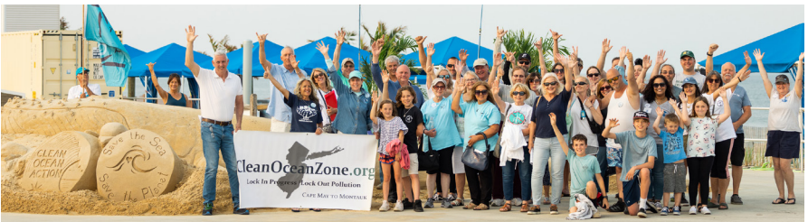
Ocean advocates gather at COA's World Ocean Day event in Seaside Park, NJ, to protect the ocean from reckless industrialization