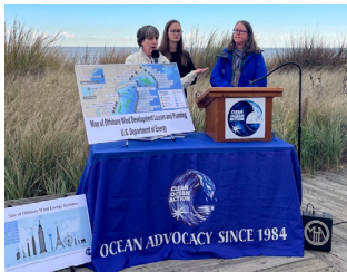
Press conference announcing new petition to stop NJ's expansion of reckless ocean industrialization

Led campaigns with thousands of people for responsible, reasonable, and accountable protections of the ocean and marine life. COA's petition for a federal investigation into the unprecedented deaths of 38 whales and 60 dolphins/porpoises in NY/NJ Bight supported by nearly 400,000 people.