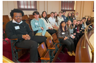
SEALs visit the NJ State House Senate Chamber

For the first time, COA hosted five Student Summits . In NJ at Sandy Hook, Island Beach State Park and Cape May. In NY at Great Kills Park. The Summits provided oceanside education to 1,174 students from 49 middle schools.