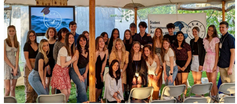
Thirty SEAL students and their families gathered at COA HQ to share their final projects and graduate