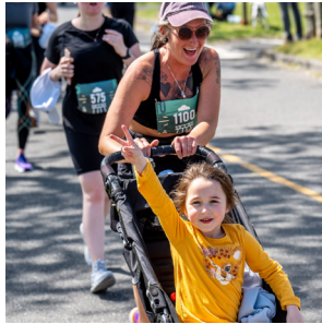
Families spend Mother's Day at the Run the Hook race to keep Mother Ocean pollution free