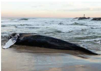
Whale #11 stranded in Manasquan, NJ

Led campaigns with thousands of people for responsible, reasonable, and accountable protections of the ocean and marine life. COA's petition for a federal investigation into the unprecedented deaths of 38 whales and 60 dolphins/porpoises in NY/NJ Bight supported by nearly 400,000 people.