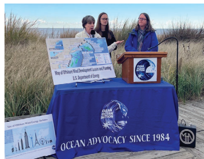
Press conference announcing new petition to stop NJ's expansion of reckless ocean industrialization

Led campaigns with thousands of people for responsible, reasonable, and accountable protections of the ocean and marine life. COA's petition for a federal investigation into the unprecedented deaths of 38 whales and 60 dolphins/porpoises in NY/NJ Bight supported by nearly 400,000 people.