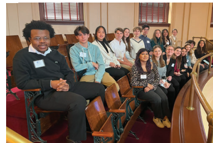
SEALs visit the NJ State House Senate Chamber

For the first time, COA hosted five Student Summits . In NJ at Sandy Hook, Island Beach State Park and Cape May. In NY at Great Kills Park. The Summits provided oceanside education to 1,174 students from 49 middle schools.