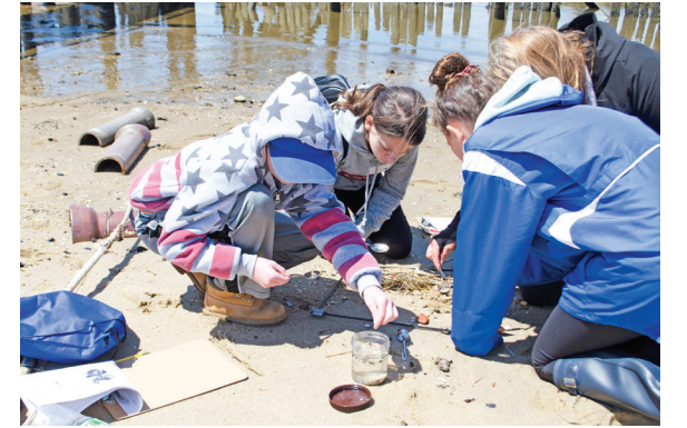
Applications are being accepted now for the Spring Student Summit in May 2020

Public and private middle schools (Grades 5-8) located in northern and central New Jersey Counties are invited to apply. The program is free. Schools must send an application, a $100 refundable deposit, and signed Terms of Participation by March 31, 2020, to COA by mail. For an application, see our website or contact Kari.