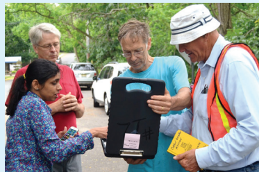
Interested in Being a Citizen Scientist? Find out how to get involved!