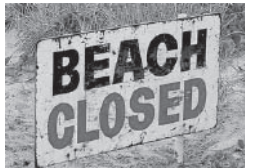
No more warnings? President Obama proposes to end beach water testing

("Three New Threats" continued, see Science & Policy News, page 2)