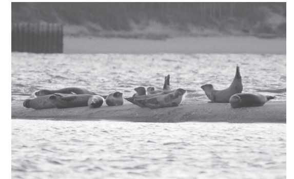
Approximately 30 seals were viewed by attendees at Sandy Hook during our Celebrate Winter Wildlife Event on February 19th