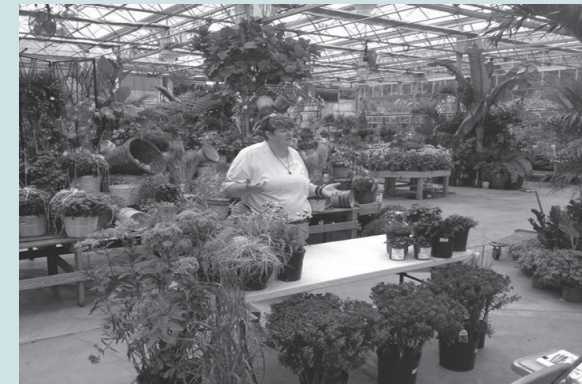
Rain Garden Workshop at Dearborn Market

In September, COA urged citizens to assist in long-term recovery through Waves events including: