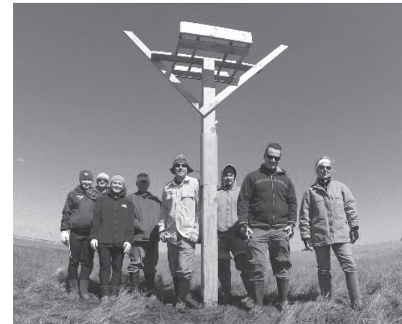
Replacing osprey nests in Stafford Twp.