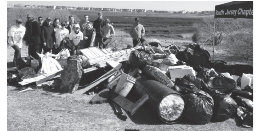
Volunteers cleaning the marshes of Brigantine