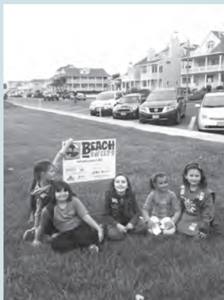
Girl Scout Troop 777 in Bradley Beach