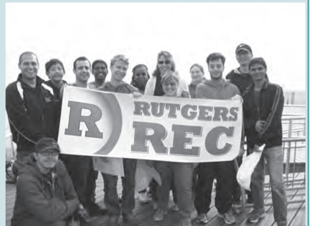
Rutgers University Scuba Club at Belmar 16th Avenue