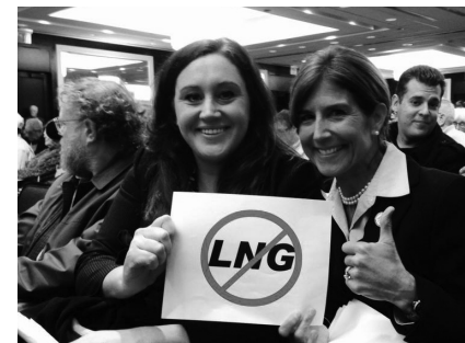
Assemblywoman Casagrande and Senator Beck oppose Port Ambrose.