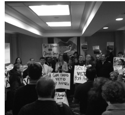
LNG Public Hearing Press Conference in Jamaica, NY.