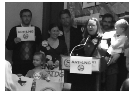
Citizens speak against the proposed LNG Facility in Eatontown, NJ.