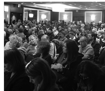
LNG Public Hearing in Eatontown, NJ.