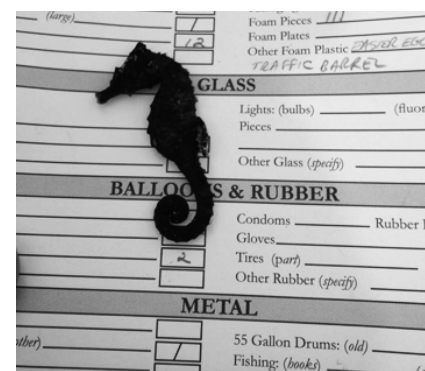
Seahorse found at the Ortley Beach location.