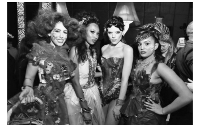
Winners of Aveda's Trashion Show

Everyday we can make a difference for clean and available water by watching our consumption, re-using water, and educating those around us to do the same. For more ways to lessen your impact, please visit our website.