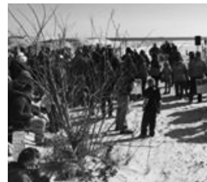
Rally with elected officials and sponsors in Sandy Hook.