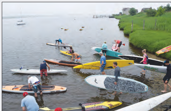
Preparing for the race!