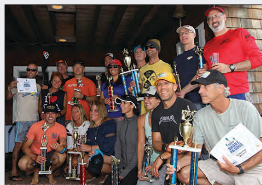
Race winners proudly displaying their re-purposed trophies