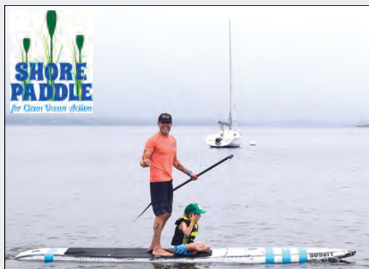
What a great way to spend Father's Day weekend!