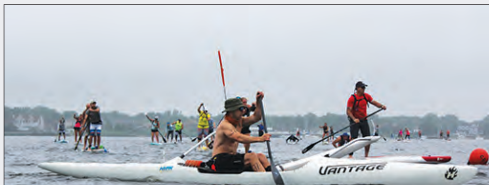
Outriggers and surfskis participated this year for 1st time!