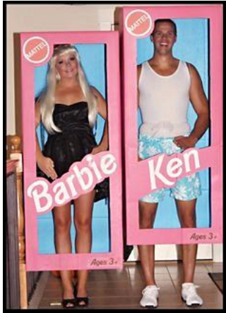
Costume for Couples