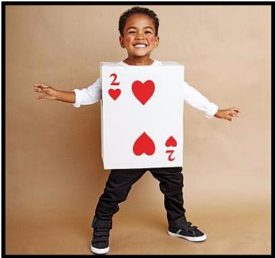
Costume for Children