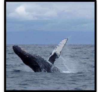
Marine life at risk! Over one million acres of ocean leased for wind energy off NY/NJ.

Offshore wind energy is renewable but will impact the ocean and marine life. The scope, scale, magnitude, and speed of the industrialization of over one million acres for wind energy are unprecedented for the marine ecosystem just off the New York/New Jersey Coast; the current development is nearly the size as Grand Canyon National Park, with more to come. There will also be cumulative impacts – currently unknown by science – from offshore wind facilities proposed from Massachusetts to North Carolina. There are few laws protecting marine life. The large-scale development of the NY & NJ lease areas is too much, too fast . The risks are high. There are cheaper, faster, and safer energy-wise solutions that can be implemented now on land, while a pilot study determines how to conduct offshore wind in an environmentally responsible manner.