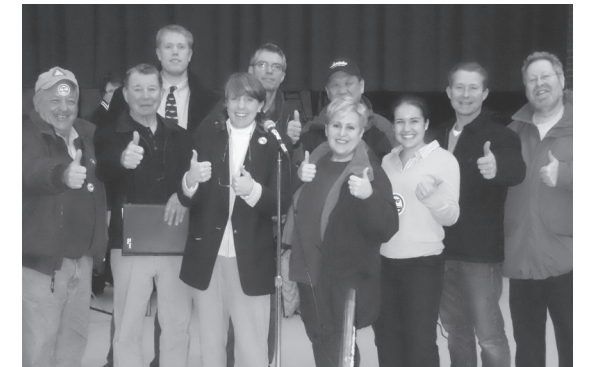
NY Coalition Members celebrate with news that the hearings were cancelled!

Clean Ocean Action will keep you informed of developments. You can stay connected by reading our blog and regularly visiting our website at www.cleanoceanaction.org .