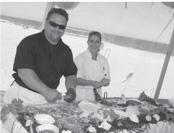
Guests enjoyed seafood from the Lusty Lobster