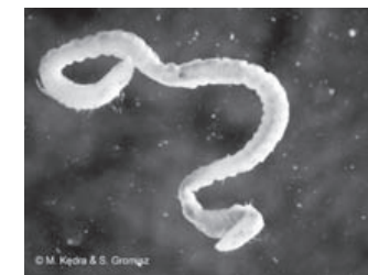
Tharyx sp. was one of the most abundant worms identified

Rutgers University released the most comprehensive study of the ocean's benthic life along the Jersey Shore done to date. This study documented the numbers, types, and distribution of benthic sea life, animals that live in the sandy seafloor, including clams, worms (see left photo), snails, and other critters. Scientists cataloged over 270 different kinds of animals (113,177 critters total) from samples within the first three nautical miles of shore (the study's geographic extent). An average of 432 animals per sampling station was found in 2007, and 1,321 in 2009.