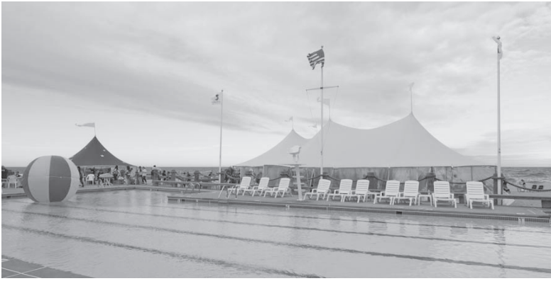
Perfect Beach Ball weather at Ship Ahoy Beach Club