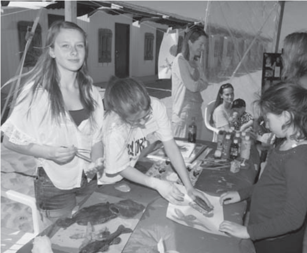
Student volunteers assisted Sandy Hook Child Care Center and Beach Chik Designs in their eco-friendly crafts and games