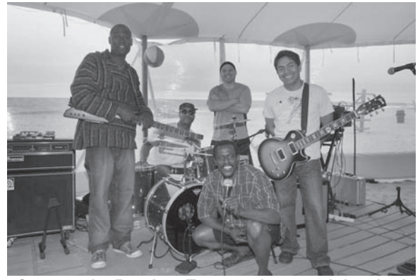
Once again, Random Test got the crowd dancing!

Clean Ocean Action's 8 th annual Family Beach Ball took place on Sunday, May 20, at Ship Ahoy Beach Club in Sea Bright, New Jersey. Two hundred guests celebrated the ocean and the forthcoming summer season with reggae music and great food and drink. New Jersey State Senator Joe Kyrillos (R-13) attended and showed his support for the Clean Ocean Zone, and complimented COA's efforts to enact permanent protections for the New York/New Jersey Bight.