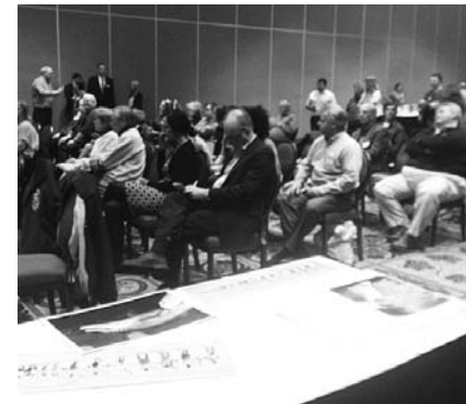
Attendees listening to public testimony.