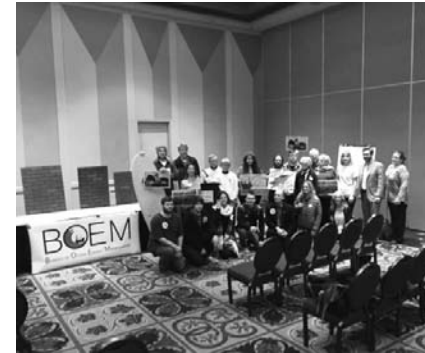
BOEM Citizens Hearing & Press conference in AC. Note BOEM represented as brick walls.