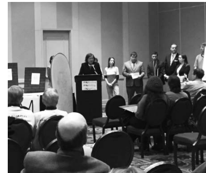
Mayor Suzanne Walters of Stone Harbor speaking out against oil drilling proposal.