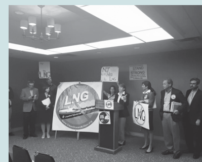
NJ Press Conference