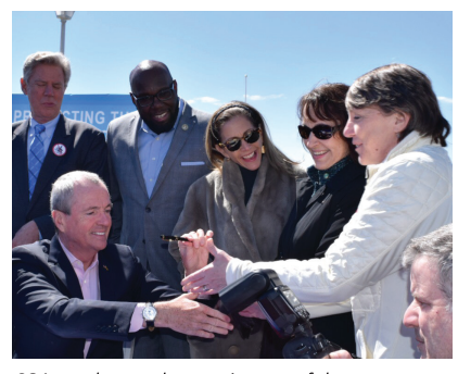
COA was honored to receive one of the pens that the Governor used to sign the bill into law

bi-partisan support from the NJ legislature. It also affirms the importance of the ocean to the state's economy and psyche—from High Point to Cape May Point, most agree—the Jersey Shore is a Clean Ocean Zone and a no-go zone for ocean industrialization.