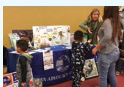
Bayview Elementary School