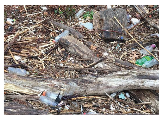
Over 96% of debris removed from Red Bank Battlefield Park was plastic, which includes everything from plastic bottles to tiny pieces of foam.

Marine debris may seem the most visible at the Jersey Shore, but it is crucial to remember that marine debris often starts out as inland litter that is carried to our waterways through stormwater runoff.