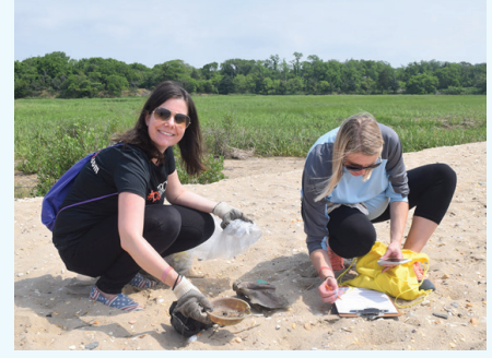
Corporate Beach Sweep volunteers counting and recording marine debris

Did you know 445 volunteers from 14 corporations helped to remove 33,161 pieces of pollution last