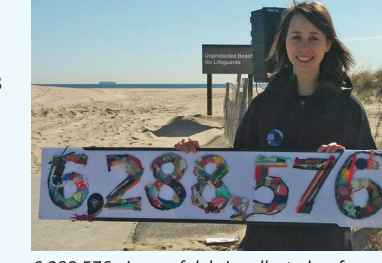
6,288,576 pieces of debris collected so far over the past 32 years of COA's Beach Sweeps

Volunteers are encouraged to note any out-of-the-ordinary finds which COA labels as