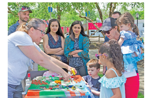
COA uses EnviroScape as an educational tool