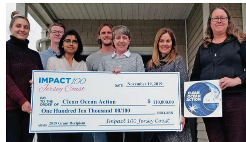
COA staff gathers to say waves of thanks to Impact 100 Jersey Coast.

Additional Awardees are: Asbury Park Music Foundation, Court Appointed Special Advocates, and St. Mark's Center for Community Renewal. Stay tuned as we roll-out the program. Waves of thanks, Impact 100 Jersey Coast!