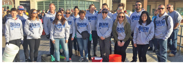
Vantage Apparel team sporting "Beach Sweeps" hoodies at the Asbury Park Beach Sweep

COA is excited to announce a new partnership, through the "1% for the Planet" program, with Vantage Apparel. Vantage Apparel is a top-ranked corporate apparel brand. Through this partnership, COA will receive a portion of the revenue from Vantage Apparel's new sustainable line of clothing. The new line will feature high quality garments produced in an environmentally conscious manner. Most notably, the garments in this line will be made partially from recycled plastic bottles. While the line has not yet been released, Vantage Apparel chose to donate $1,000 to COA in an initial show of generous support. Vantage Apparel took their support a step further in the fall and created special "Beach Sweeps" hoodies for their staff, as well as COA's staff. This partnership shows great promise and COA salutes Vantage Apparel for their initiative and drive to protect our ocean and beaches.