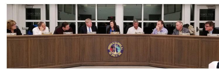
Sea Bright passes ordinance to limit or ban plastic bags, utensils, straws and balloons, and plan to enhance bill on December 17