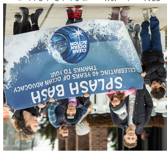
(2 apaq, strighlights, page 5) COA Launches 40 Years with Splash Bash Celebration

An extension to the comment period was granted to March 13! Thank you