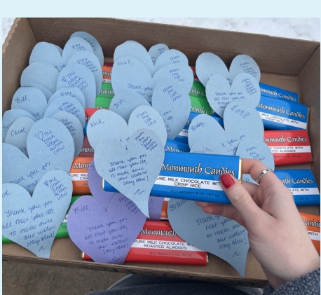
Valentines of appreciation for COA's volunteer Community Scientists