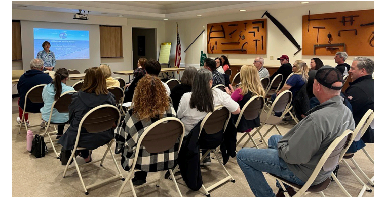
Members of the Cape May Court House community attend COA's offshore wind information session

If you would like to host or see information sessions like this in your area, please contact Outreach@CleanOceanAction.org .