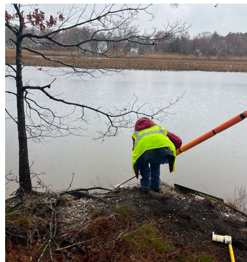
COA's Swarna collects a water sample for testing

COA continues to seek and recruit more volunteers to serve as community scientists. For more information or how to get involved, please contact Programs@CleanOceanAction.org .