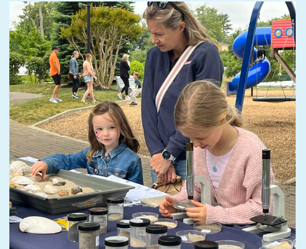
Children and families learn about the environment and ways to be an environmental advocate at Eco-Fest

To ensure your sponsorship spot and inclusion on marketing materials, please respond by May 17, 2024.