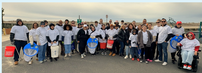
Bank of America team members participated at Margate City Beach (pictured), West Deptford, and Sandy Hook