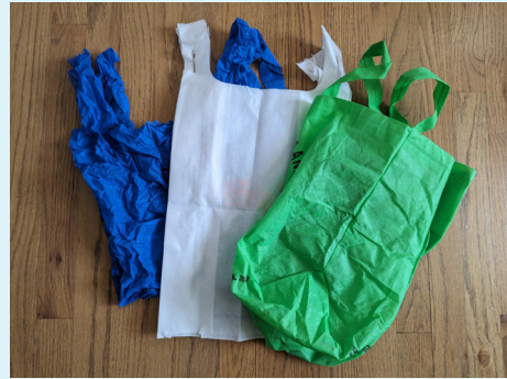
Flimsy, heat-stitched "ultrasonic" bags with low durability defined as "reusable" included in NJ's proposed Get Past Plastic regulations

May 4, 2024, marks the two-year anniversary of New Jersey's "Get Past Plastic" law, which prohibits businesses from distributing plastic and paper bags and foam take-out containers, and limits straws to availability upon customer request. The ban on plastic bags has succeeded in eliminating plastic waste. According to data collected from COA's 2022 Beach Sweeps, as well as data from the NJ Food Council as of May 2023, the law has been successful in eliminating billions of plastic bags and single-use paper bags from the waste stream.