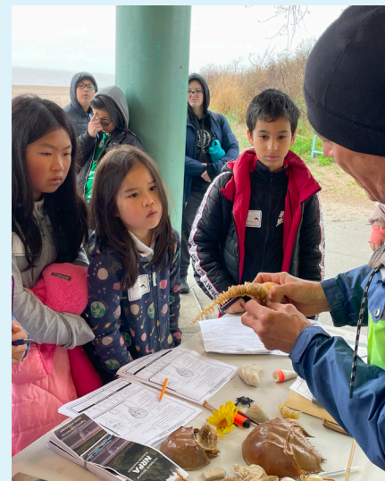
Learning about whelks, horseshoe crabs, and more at the Staten Island Student Summit

Waves of thanks to the workstation and field trip leaders from Billion Oyster Project, Staten Island Zoo, NYC H2O, NYC Parks – Urban Park Rangers, Blue Heron Nature Center, NY/NJ Baykeeper, and Duro Workforce. By sharing their knowledge and skills, over 100 students received valuable information in marine sciences, including learning about local watersheds and how to protect them and the value of oysters and local marine life. From learning how to kayak, to sweeping the beach at Great Kills, students walked away with connections to the ecosystem that will last. COA appreciates the dedicated teachers and chaperones, and the enthusiastic students, who made the event a success!