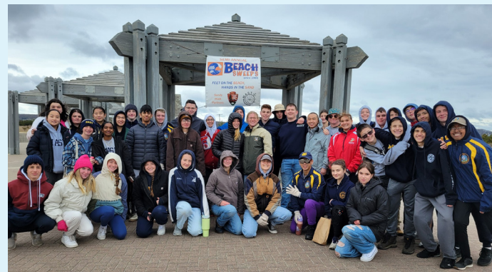
MAST students helped set up for Beach Sweeps registration and welcomed volunteers at Sandy Hook