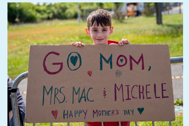
Families show up to support mothers, friends, and loved ones participating at Run The Hook

BIB Pick-up: Road Runner Sports, Shrewsbury, NJ on Saturday, May 11, 2024 (11AM – 2 PM) or Race Day at Field 102 starting at 8:30AM. Advanced pick-up is highly encouraged!