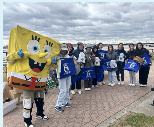
Special guest, SpongeBob SquarePants, at the first-time Perth Amboy Beach Sweeps site with other volunteers