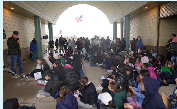
Students gathered to kick-off the 5th Annual Staten Island Student Summit