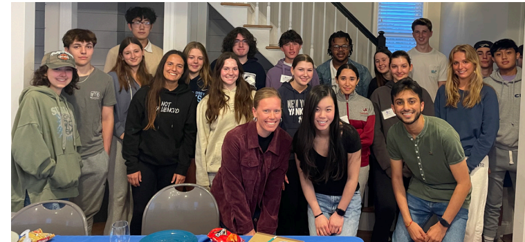
Rutgers University Nanoplastic Research Students (front) presented to the SEAL Students

In April, students from Rutgers University presented research insights on the topic of microplastics to the Student Environmental Advocates and Leaders (SEAL). The research findings and revelations were shocking and gave the SEALs a glimpse into what the life of a research student can look like and topics they can study. Exposure to different career paths and opportunities in the environmental field is an important part of the SEAL program as many of the high school students prepare to continue in their educational and environmental journeys in the next couple of years or less. Thank you to the Rutgers students who shared their