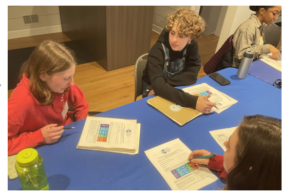
SEALs discuss plans and processes for their community-based projects