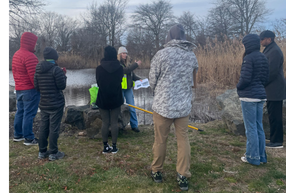
Volunteers gather to learn how to collect water samples for testing