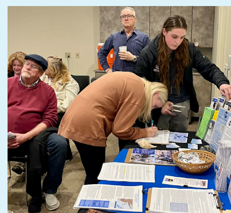
Attendees learn about COA campaigns

Our next south Jersey COA Meet and Greet is on March 26th at the Tuckerton Seaport & Baymen's Museum in the Hunting Shanty building. More details coming soon at CleanOceanAction.org