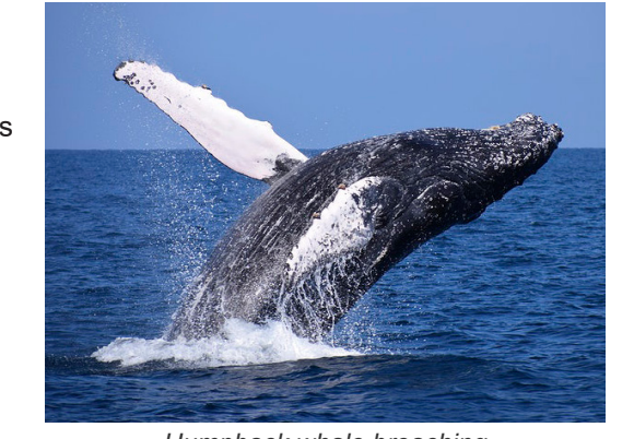
Humpback whale breaching

Take Action: Your voice is needed! Send comments with concerns to ITP.Clevenstine@noaa.gov by February 5, 2024.