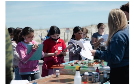
Spring Student Summit 2022 Students in grades 5-8 learn lessons in environmental stewardship.