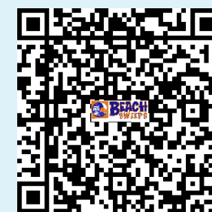
2022 Beach Sweeps Annual Report