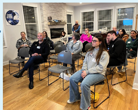
COA Meet & Greet 2023

On Tuesday March 7, we welcomed new volunteers to the COA house. This mighty crew came with array of skills and backgrounds, anywhere from former Department of Environmental Protection staff to self-made Etsy entrepreneurs, but all shared a similar passion—protecting the ocean! It was great to see individuals of all ages and from all over the state come together with ideas, questions, and eagerness to make waves. We look forward to the eventful months ahead with all of you and are happy to have your true-blue support!