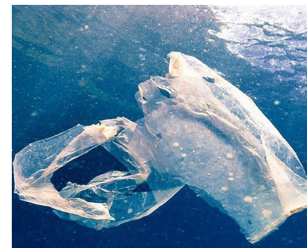
A reason why we need the Plastic Bag Ban law.

On May 4, 2022, the "Single-Use Waste Reduction Act," which bans plastic bags and foam take-out containers, and limits straws, went into full effect. After just 5 months, the NJ Food Council estimated that 3.44 billion plastic bags and 68 million paper bags were eliminated from the waste stream. Progress was also evidenced by the 2022 Beach Sweeps data with these three bad litter actors (plastic bags, straws and foam containers) declining on local beaches by over 35% (see story page 4).