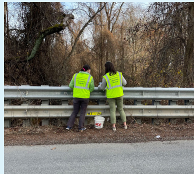
Community Scientists gathering water samples for road salt monitoring.

Excess salt from deicing applications can enter our waterways through runoff and negatively impact fish and other wildlife. Community scientists trained by COA brave wintry weather to test waterways in the Two Rivers Watershed for chloride (salt) levels from January to April. This community monitoring effort will help to determine the impacts of deicing and road salt applications on upstream tributaries in the watershed.