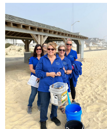
Beach Sweeps, Manasquan Beach Ladies of the fabulous Women's Club of Manasquan.