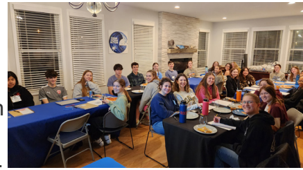
Bi-weekly SEAL Meeting 2023 SEAL students gather for their meeting

The SEAL Program empowers youth to make a difference through civic engagement and project implementation for their communities. The future is bright with SEALs!