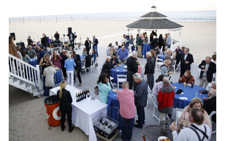
Shore Shindig 2022