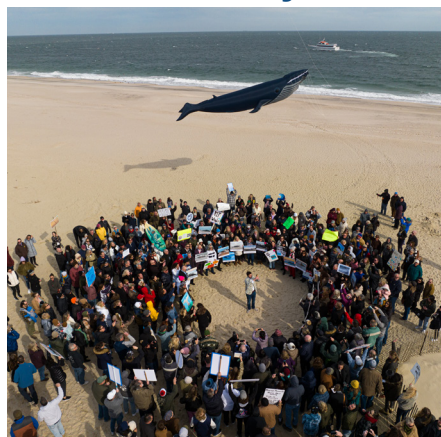
Save the Whales Rally, Point Pleasant, NJ