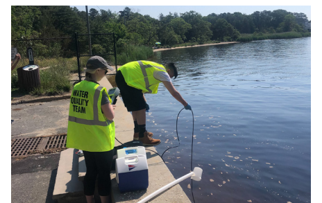
Citizen Scientists Testing Water Quality Volunteers from COA's Community Science Program test the waters for pathogens.