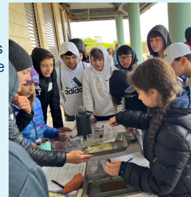
Soak It Up! Students learn about stormwater water run-off, absorbency, and how these activities affect our watershed.

It was a wonderful day of hands-on, outdoor environmental education by the sea!