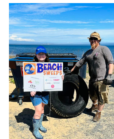
Beach Sweeps-Atlantic Highlands Thank you, 4-H Kindness Club, for being friends of the ocean and spreading Earthly kindness!