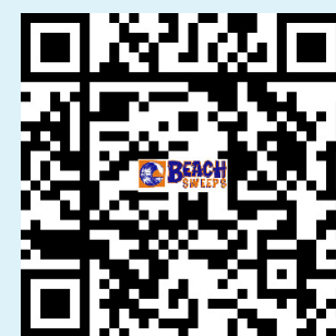
Spring 2023 Beach Sweeps Photo Gallery