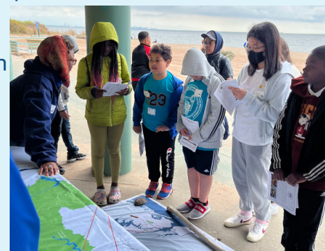
NYC H2O Students learn about NYC's drinking water.