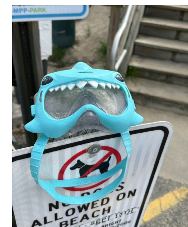
Beach Sweeps, Sea Bright-Anchorage A volunteer found shark swimming goggles!