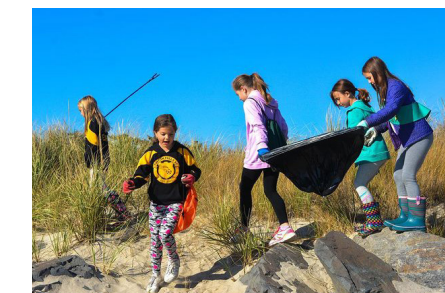
Beach Sweeps 2022 Girl Scouts being true-blue ocean advocates cleaning the seas from debris!