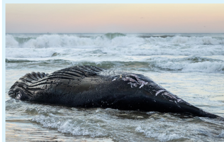
Whale # 10 in Manasquan, NJ