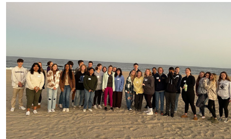
SEALs gather on the beach.