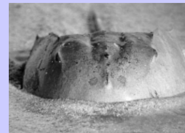
April Coastal Creature

April Creature: This spring, just as they have done for the past 200 million years, this gentle creature will gather along bay beaches in this region to mate. As they emerge from the muddy bay bottoms where they spend most of their lives, they are recognized by their spiny tail and helmet-shaped body (pictured right). Thanks to the American Littoral Society and NJ Audubon Society, this creature has recently caught the attention of the NJ State Legislature, and harvesting them for bait is now prohibited. For a chance to win a COA T-shirt, submit your guess to COA by mail, fax, or email (18 Hartshorne Dr., Suite 2, Highlands, NJ 07732; 732-872-8041; Education@CleanOceanAction.org), or complete the online form at www.CleanOceanAction.org .