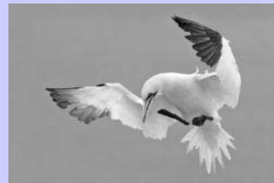
Getting ready to dive! Northern Gannet, Morus bassanus

April Creature: This spring, just as they have done for the past 200 million years, this gentle creature will gather along bay beaches in this region to mate. As they emerge from the muddy bay bottoms where they spend most of their lives, they are recognized by their spiny tail and helmet-shaped body (pictured right). Thanks to the American Littoral Society and NJ Audubon Society, this creature has recently caught the attention of the NJ State Legislature, and harvesting them for bait is now prohibited. For a chance to win a COA T-shirt, submit your guess to COA by mail, fax, or email (18 Hartshorne Dr., Suite 2, Highlands, NJ 07732; 732-872-8041; Education@CleanOceanAction.org), or complete the online form at www.CleanOceanAction.org .