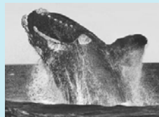
North Atlantic Right Whale Eubalaena glacialis

December Creature: During the coming winter months, when temperatures in their North Atlantic breeding grounds begin to fall, this species migrates to more southern locations, including the NJ coast. In the United States this creature, sometimes called a "sea dog," is no longer threatened by hunters and now enjoys the recovery of some of their favorite foods, like sea herring. To enter for a chance to win a COA T-shirt, send your guess by mail, fax, or email (18 Hartshorne Dr., Suite 2, Highlands, NJ 07732; 732-872-8041; education@cleanoceanaction.org )