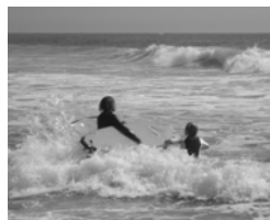
A new rapid water test can protect beach-goers

US Representative Frank Pallone, Jr. (NJ-D-6) introduced a bill to amend the BEACH Act, which provides for nationwide water testing at public beaches. Pallone's bill introduces requirements for rapid testing methods (see article below), which would result in faster public notification when coastal waters are polluted. Rep. Oberstar (MN-D-8) introduced a substitute bill in the Transportation and Infrastructure Committee, which he chairs. Oberstar's bill was "marked-up," making it available for consideration before the full US House of Representatives.