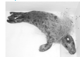
An entangled grey seal

The Marine Mammal Stranding Center (MMSC) in Brigantine, NJ, seeks volunteers to respond to sick or injured marine mammals and sea turtles in the state, especially Monmouth County. Volunteers respond to calls received by the Center, help keep the stranded animal safe until staff arrives, photograph and identify animals, and sometimes help staff with safe animal transport.