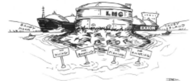
THE FUTURE NY/NJ COAST?