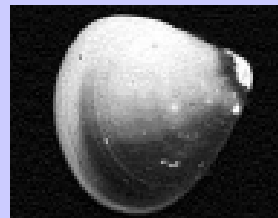
Amethyst Gem Clam Gemma gemma