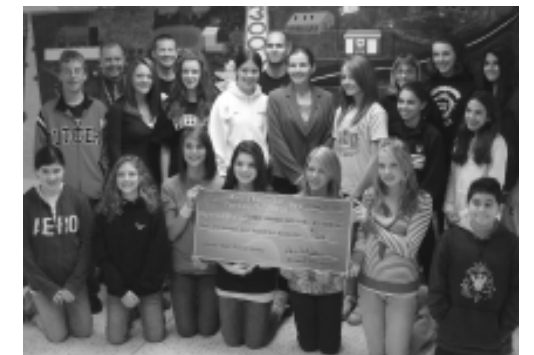
Students & teachers of Eisenhower Middle School present their efforts to COA