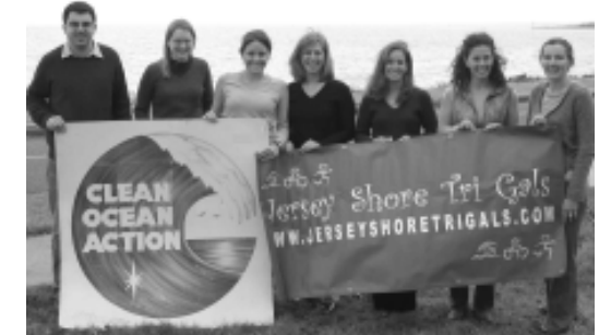
Tri Gal Board Members & COA Staff

The mission of Jersey Shore Tri Gals is to provide an emotionally and physically safe environment for women of all ages to train and compete in swimming, biking, and running events. Visit www.jerseyshoretrigals.com for more information. COA thanks all the Tri Gals!