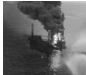
The Dangers of Drilling: A fire in 2007 on an oil rig, Gulf of Mexico

See the video (at 5:10 mark): http://www.youtube.com/watch?v=0EK6wEmErJs .