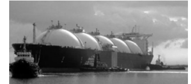
LNG tankers are nearly 4 football fields in length

The law that will apply to this application is the Deepwater Port Act (same as the proposed LNG island, see article below ). However, the specific location has not been revealed so it is not clear if New Jersey will have a role in the review process as an "adjacent coastal state."