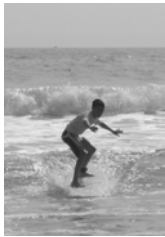
Same-day, rapid water tests would protect beach-goers

Recently, COA met with staff at the Washington, DC, offices of Reps. Frank Pallone, Jr. (NJ-D-6) and James Oberstar (MN-D-8), Chair of the Transportation and Infrastructure Committee, who are seeking to introduce a Bill to amend the BEACH Act. The BEACH Act provides measures for water quality testing at public beaches, but it is in need of improvements. For example, the law needs to require the use of rapid testing methods for bacteria so beach-goers know that day, not the day after, whether it is safe to swim.