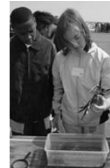
Students get a close look at a crab

For information about the Student Summit program, visit www.CleanOceanAction.org or call COA's Sandy Hook Office.