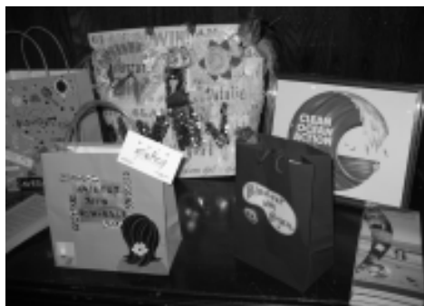
In 2007 salon professionals at Pure Energy Hair Studio in Nutley, NJ, donated their time and energy toward a raffle and Earth Month celebration to raise funds