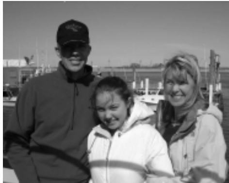
The Cosgrove Family of Bahrs Restaurant