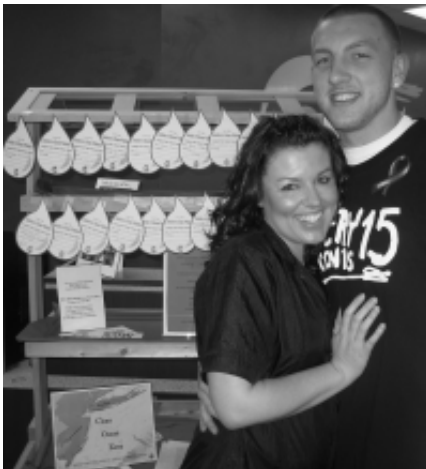
Gullo's Salon & Beauty Boutique in Medford, NJ, sold Clean Ocean Zone “drops,” hosted a Cut-a-Thon, and more to raise funds in Earth Month 2007

April 20 - Art+Science Salon, Philadelphia, PA, 12-6pm