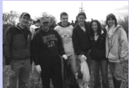
US Senator Menendez joins volunteers from MAST and friends for the cleanup at Sandy Hook