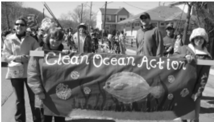
Volunteers march with banner made by Monmouth Regional High School Environmental Club in the Highlands St. Patrick's Parade to advertise COA's tournament