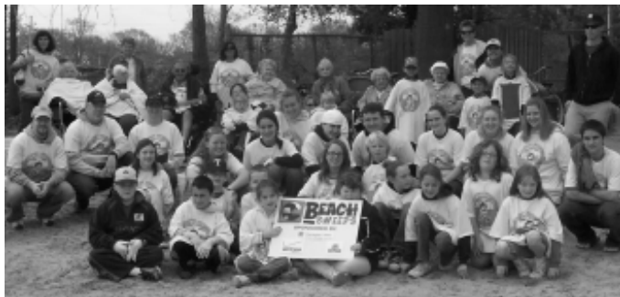
57 volunteers, including residents and employees of Claremont Center, cleaned river beaches in Pt. Pleasant

Union Beach: 35+ volunteers picked-up one of the most unusual items -- an upright vacuum cleaner.