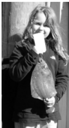
Fishing is fun for all ages!