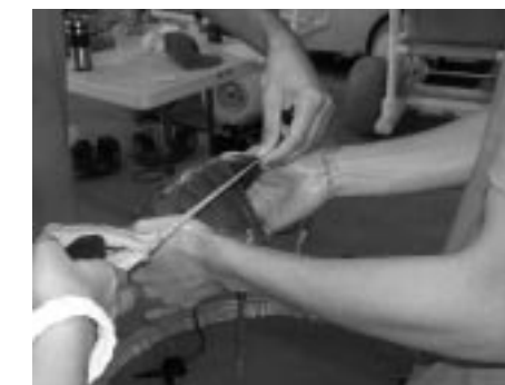
Students measure a horseshoe crab

Ten schools from four of New Jersey's southern counties attended and enjoyed a beautiful sunny day learning about the marine environment. Students actively participated in field trips within the park, led by volunteer educators. The students also experienced a series of hands-on learning stations, which included touch tanks with live animals, a coastal nonpoint source pollution model, shell identification, and, the favorite station, live horseshoe crabs (see right) and terrapins!