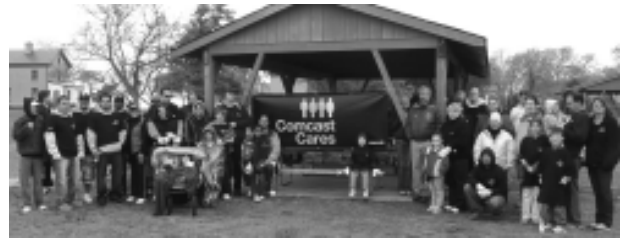
Comcast gears up for a clean sweep