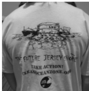
Front: "Stop the Insanity" Back: Cartoon, "The Future Jersey Shore?"

Complete & clip form; send with check to: Clean Ocean Action, 18 Hartshorne Drive, Ste. 2, Highlands, NJ 07732. To pay with MasterCard or Visa go to www.cleanoceanaction.org or call 732-872-0111.