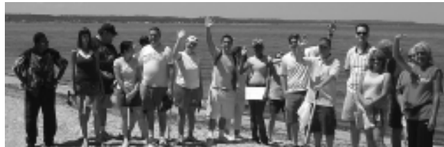
Johnson & Johnson and Morgan Stanley volunteers share pride for work well done