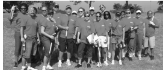
Ricoh ready for sweeping!

5,497 plastic food and candy wrappers 4,652, plastic bottle caps and lids 4,228 pieces of plastic and foam 3,434 plastic straws and stirrers 2,536 cigarette filters