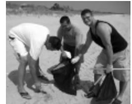
Ameriprise Financial hard at work, Sandy Hook