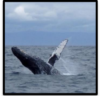
Marine life at risk! Over one million acres of ocean leased for wind energy off NY/NJ.

Offshore wind energy is renewable but will impact the ocean and marine life. The scope, scale, magnitude, and speed of the industrialization of over one million acres for wind energy are unprecedented for the marine ecosystem just off the New York/New Jersey Coast; the current development is nearly the size as Grand Canyon National Park, with more to come. There will also be cumulative impacts – currently unknown by science – from offshore wind facilities proposed from Massachusetts to North Carolina. There are few laws protecting marine life. The large-scale development of the NY & NJ lease areas is too much, too fast . The risks are high. There are cheaper, faster, and safer energy-wise solutions that can be implemented now on land, while a pilot study determines how to conduct offshore wind in an environmentally responsible manner.