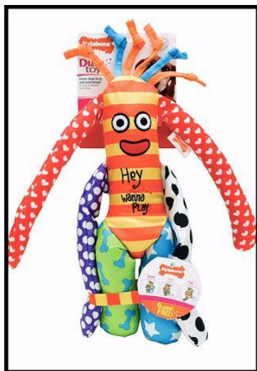
You could win this Nylabone toy at COA's Sandy Paws event!