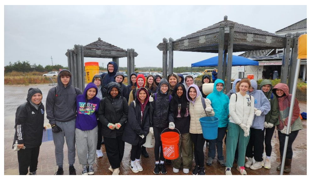
Buckets and smiles as the Verona High School marine bio club gathers at Sandy Hook for the Fall 2023 Beach Sweeps

COA's Beach Sweeps, held every April and October, is New Jersey's largest, longest-running volunteer-driven, citizen science and environmental event. The site locations are from Montclair to Cape May with additional sites along the Delaware River. Over the years of Beach Sweeps, 169,565 volunteers have contributed 982,284 volunteer hours to remove and record debris from NJ's beaches and waterways.