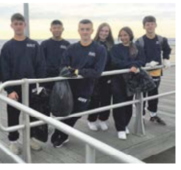
Colts Neck High School ROTC students