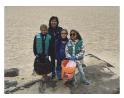
Girl Scouts in Spring Lake