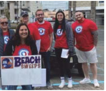
County Sponsor Target volunteers in Keansburg