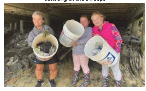
Volunteers remove buckets full of trash at Riverfront Park, Point Pleasant