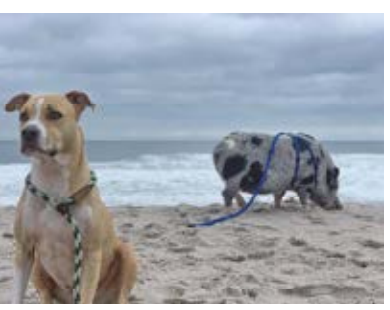
Four-legged Beach Sweepers at Ortley Beach