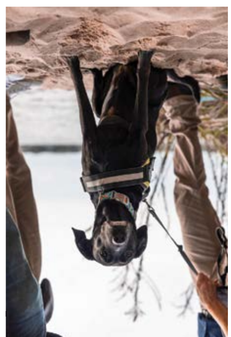
Sniffing Out Poo-Ilution in the Toms River... See Inside!