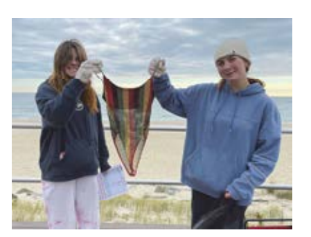
Odd find: an abandoned swimsuit on Brighton Ave beach in Long Branch!