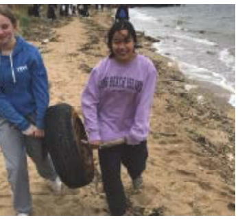
Red Bank Regional High School students remove a tire from the beach