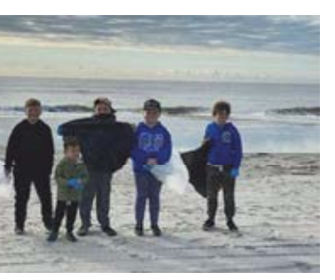
Volunteers in Ventnor City