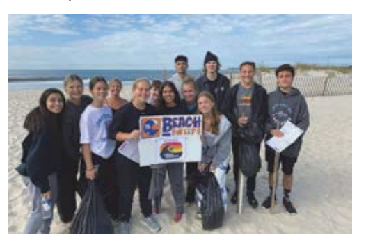
Lower Township High School students in Cape May