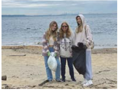
Volunteers at Ideal Beach, Middletown