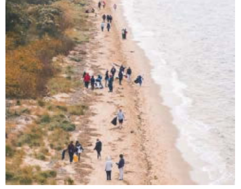
Beach Sweepers in action on Sandy Hook!

marine debris. Litter is a human caused, human solved issue.