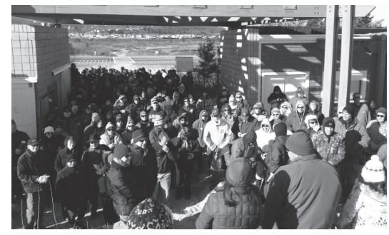
Over 300 volunteers at Sandy Hook ready to clean the beach and bay on January 19