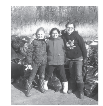
Girl Scout Troop 958 in New Dorp, Staten Island on January 19

Clean Ocean Advocate, February 2013, Page 3