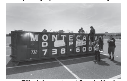
Filled dumpster at Sandy Hook