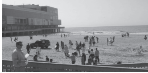
Volunteers scoured the beach in Atlantic City looking for trash and helped by sponsor Atlantic City Electric