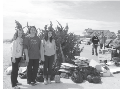
Volunteers pose post-cleanup with debris collected from the beach in 2011

The 2011 Beach Sweeps Report is posted on COA's website. Special thanks to 2011 Statewide Sponsors: Aveda, Atlantic City Electric, Bank of America, Montecalvo Material Recovery Facility, Comcast, and Verizon. Waves of thanks to the local sponsors, Beach Captains, and volunteers.