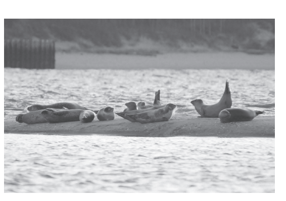
Approximately 30 seals were viewed by attendees at Sandy Hook during our Celebrate Winter Wildlife Event on February 19th