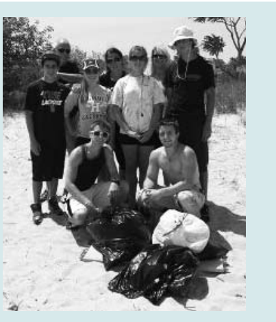
Volunteers in Aberdeen

On June 22nd, Clean Ocean Action's Waves of Action For The Shore continued with hundreds of dedicated volunteers working on projects focused on keeping waterways clean. Fourteen projects including native plant gardening; shoreline, park, beach, and community cleanups; and educational events about environmentally friendly houses, rain gardens, rain barrels, and stormwater management took place.