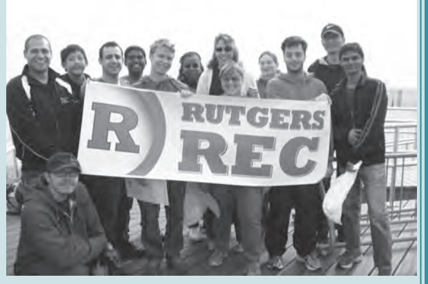
Rutgers University Scuba Club at Belmar 16th Avenue