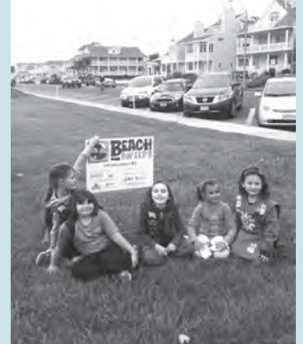
Girl Scout Troop 777 in Bradley Beach