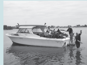
Volunteers at Shark River in Neptune, NJ

During the week of Saturday, August 17, Clean Ocean Action's Waves of Action For The Shore continued with community, kayak and marsh clean-ups. Volunteers kayaked with the Shark River Cleanup Coalition to remove debris from Shark River, N.J. Natural Resources Protective Association organized volunteers in Staten Island for a community clean-up in New Dorp, NY. Down in South Jersey, dedicated volunteers met at Tuckerton Seaport and Baymen's Museum to clean natural areas in Tuckerton, NJ.