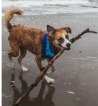
Participate from any location at any age, and leave no trace - pick up debris!

Few things bring a dog more joy than a romp on the beach. As you enjoy the dog days of summer, discover how your dog can help make a difference! COA's 3rd Annual Sandy Paws, Walk Fur Clean Water, is right around the corner and your pup is itching to play on the beach for a good cause. On October 15th , Sandy Paws walks will be held throughout NJ and the rest of the nation with the main walk held in Asbury Park, NJ. Register your dog for this year's event, join a team, organize a walk near you, or donate!