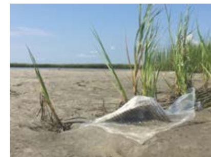
Plastic Pollution in the Barnegat Bay

New Jersey Department of Environmental Protection (NJDEP) held a meeting to discuss the status of the Barnegat Bay based on six years of intensive research and a new draft strategy for the bay's Restoration, Enhancement, and Protection for the Barnegat Bay.