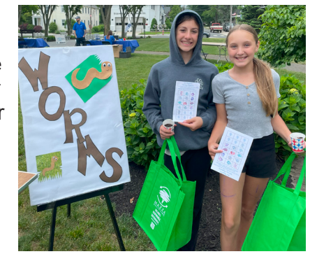
Eco-Fest attendees show off their nearly completed Passports!

Eco-Fest is coordinated as part of COA's Rally for the Two Rivers initiative— an alliance of organizations and towns dedicated to improving and protecting the Navesink and Shrewsbury Rivers.