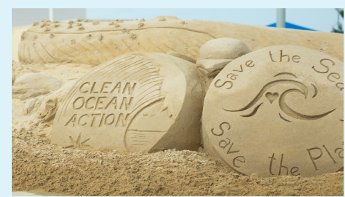
Sand sculpture created by The Bikini Boys for the COZ relaunch

Given the unprecedented, massive industrial assault proposed for the ocean, Clean Ocean Action (COA) revived the Clean Ocean Zone (COZ) legislative campaign. Originally developed years ago, the COZ is a campaign for a federal law to protect the rich vibrant life off the NY/NJ coast and lock-out harmful industrialization and pollution.