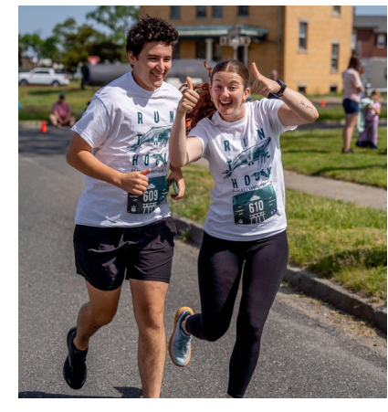
Thumbs-up for the Run The Hook race for the ocean!