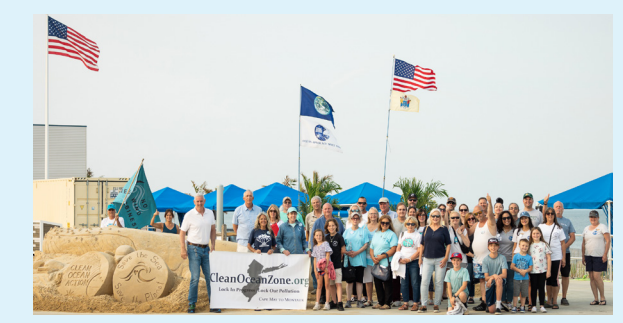
Citizens gather at Funtown Beach to relaunch the Clean Ocean Zone campaign to protect the ocean!

A beautiful, large sand sculpture of a whale and marine life created by The Bikini Boys was created for the campaign relaunch event. An Open House followed to educate and motivate citizens to become "Ocean Rebels for the COZ."