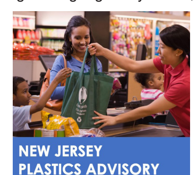
MAY 4, 2023

The first-year report is presented in four sections, including a section that identifies 20 "Opportunities for Action" recommending steps to reduce plastic waste. In year two, the PAC is studying the environmental and public health impacts of single-use plastics, as well as additional policy and legislative steps to further reduce waste and increase plastics recycling. To read the report, go to https://dep.nj.gov/get-past-plastic.