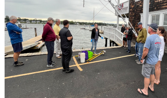
Community Scientists gather for their first Rally for the Two Rivers water sampling training!

If you are interested in volunteering as a Community Scientist for RTR, please reach out to the Water Quality team at Programs@CleanOceanAction.org . More meetings and trainings are in the works. Whether an experienced scientist or a concerned citizen, your involvement can make a significant difference to the health and well-being of our rivers!