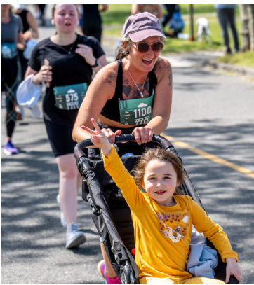
A small ocean advocate spreading peace for the sea!