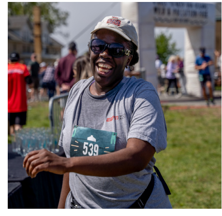
All smiles after completing the race to keep the sea pollution free!