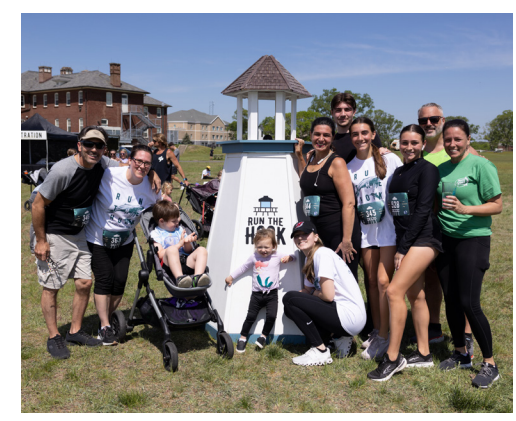
A group of participants and supporters gather at the iconic RTH lighthouse.